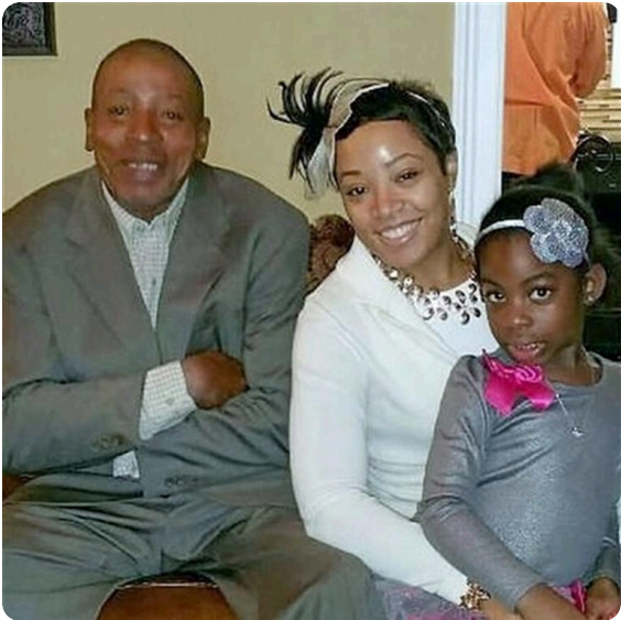
New Photo 4