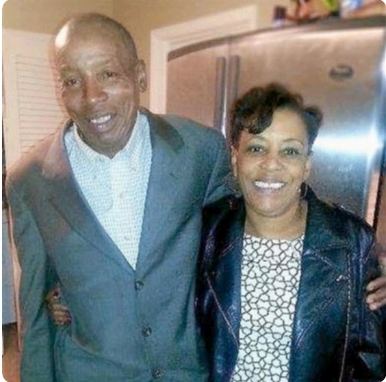
New Photo 1