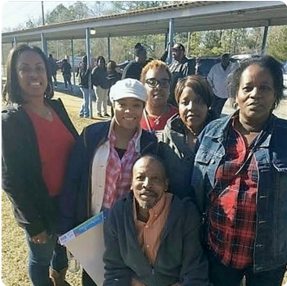
New Photo 3